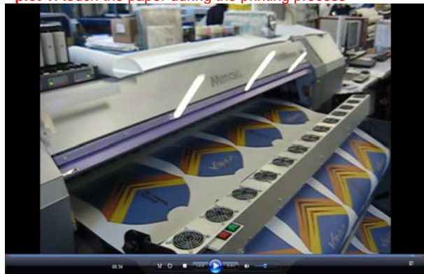
pict 2: the print job on a state-of-the-art max speed printer

We welcome you to download a copy of our “Complete Proof of Drying” video. Please contact our sales team for the link to download from our server and for further information on TRANSJET® Express .