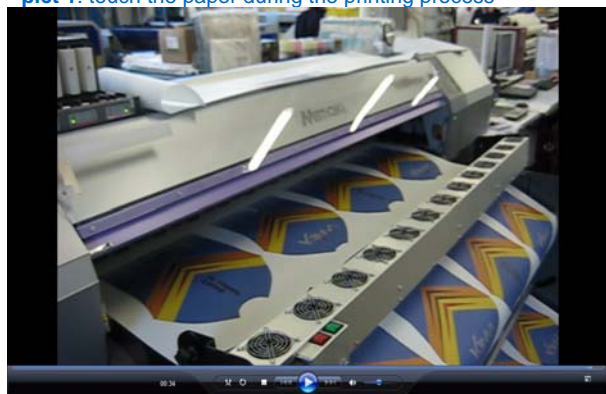
pic 2: the print job on a state-of-the-art max speed printer

We welcome you to download a copy of our “Complete Proof of Drying” video. Please contact our sales team for the link to download from our server and for further information on TRANSJET® Express.